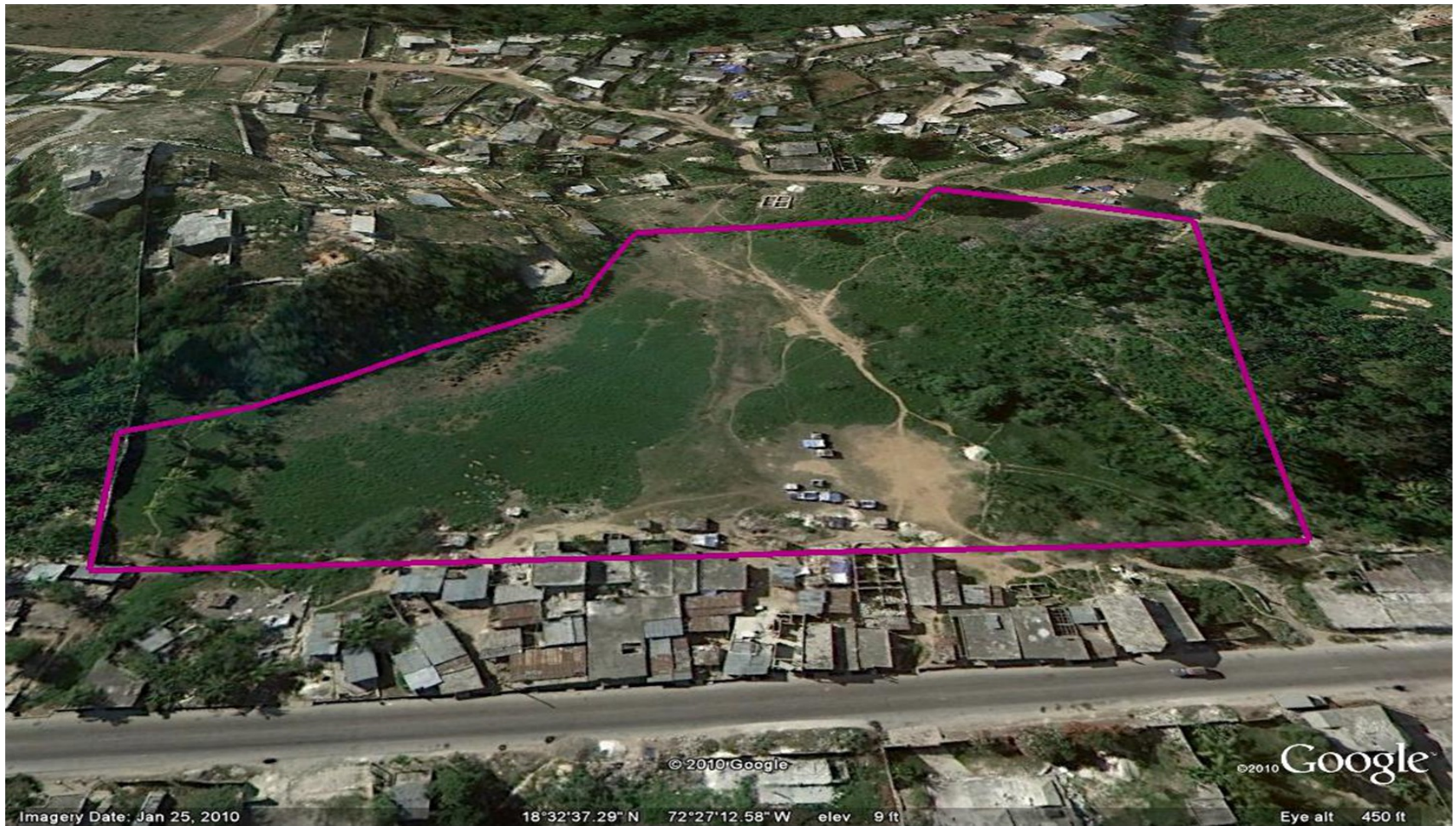
7-acre Site plan view of Lambi